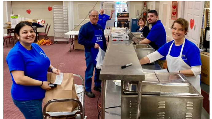
Hardworking volunteers prepare Gyros and other Greek favorites at the Gyro Bowl

We plan on having our Greek Fish Fry Fridays and because the pilot did so well last year, we are extending it to all of Lent! We will begin March 4th and host it every Friday from 5-8pm until April 15th!! Any volunteers interested please reach out to myself or a parish council member!