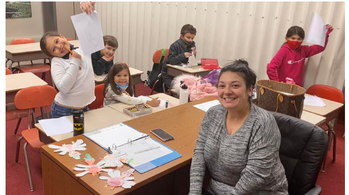
Greek School is back in session! Our students show off their work