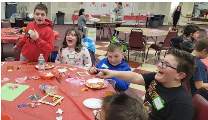
Parish youth enjoy activities at our our first ever Valentine's Kids Night In