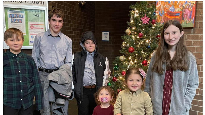
Youth from the Parish decorate our Christmas tree in the narthex