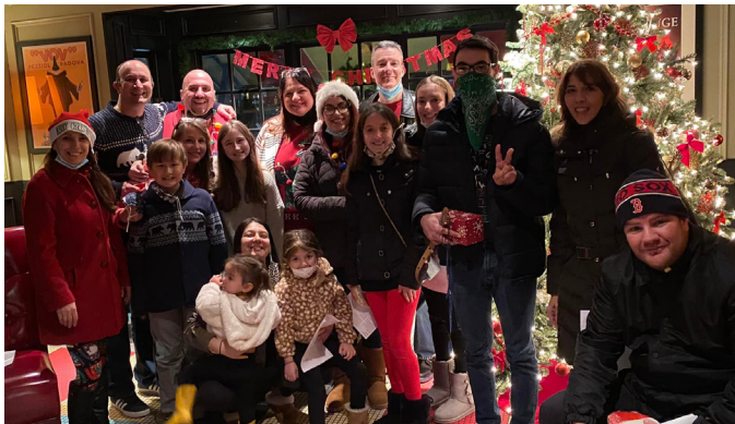
GOYans and their families caroling at local diners spreading Holiday cheer

of our chapter. We meet on the first Sunday of each month after the liturgy. Join us and I promise you your involvement will be spiritually uplifting. Your active and/or financial support enables the Philoptochos Society to be effective as a contributor to charitable organizations and to assist in fulfilling the needs of our parish. The greater the support, the greater the potential of Philoptochos to fulfill and expand its ministries. We can achieve a lot all together. Talk to anyone of our members on how you can join us. We are mothers, daughters and sisters in Christ and we will be there for you in time of need.