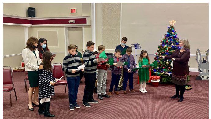
Greek School student recite poems and sing songs at their Christmas celebration