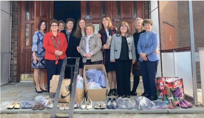
Philoptochos collects shoes and warm clothing for community members in need