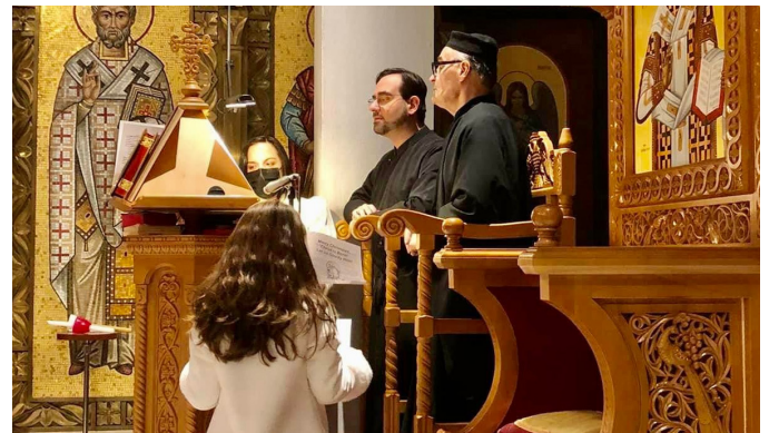
Our chanters lead the hymns during the Divine Liturgy on Christmas Eve

The Logos is proud to relaunch our bi-monthly parish newsletter this month with a refreshed layout, and new and improved content. This has been hard work by all involved from members of the committee. We look forward to continue to revive this ministry of the church. We are always looking for feedback as well as content from parishioners and advertisements that help us fund this vital ministry.