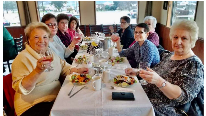
Philoptochos members raise their glasses for a holiday toast at their annual Christmas party