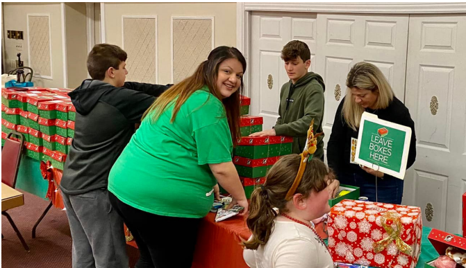
Volunteers pack care packages for children in need during our Operation Christmas Child packing night